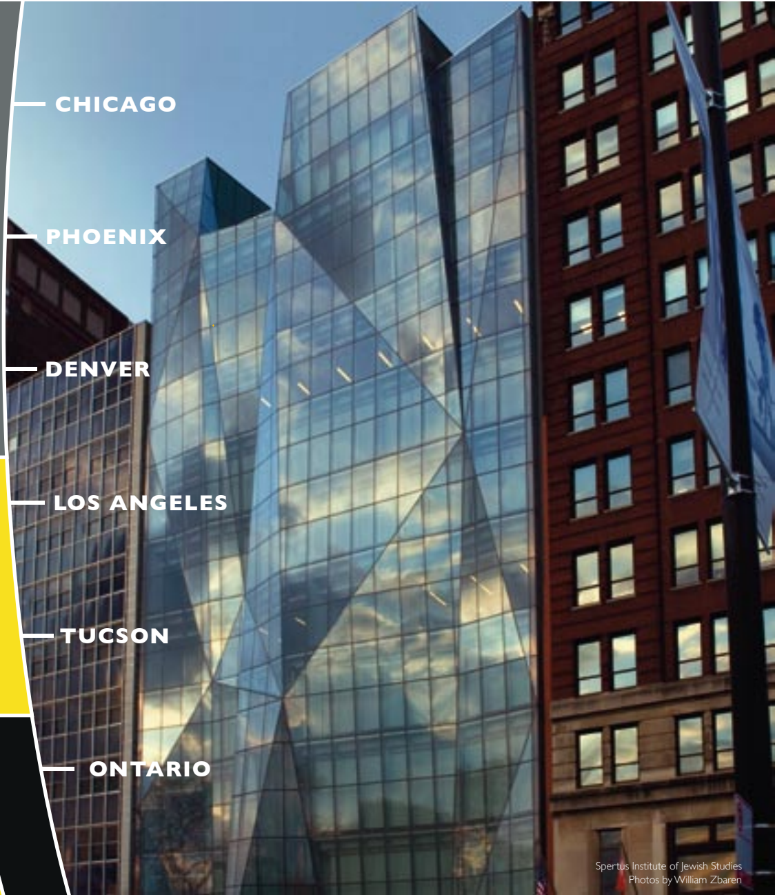
Spertus Institute of Jewish Studies